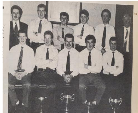
The Darragh Cross side which won the Feis Sovens hurling title were presented with their awards at the club's annual presentation dinner.