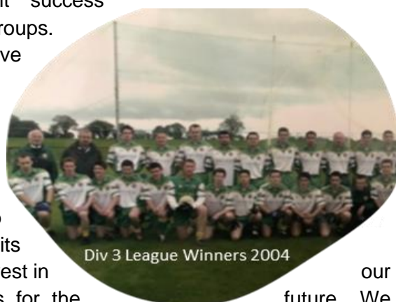
Div 3 League Winners 2004

The seniors have won several league titles including 1994,