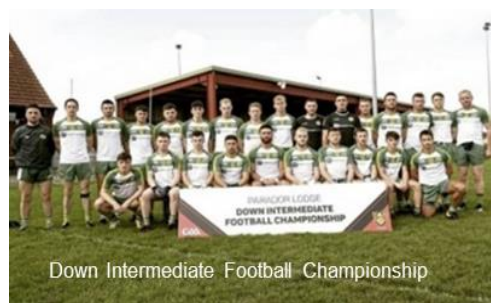
Down Intermediate Football Championship