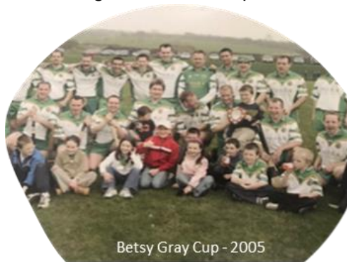
Betsy Gray Cup - 2005

Crois Darach CLG/Darach Cross GAC, or to give the club its proper title, Noah Mochais CLC, was founded in 1964 by several brave and visionary Gaels from within the local community. The first pitch was a less than appropriate field located on the main Darragh Road, where the founding members would prepare for the club's inaugural football match v Kilclief. The men of Darragh were victorious while in the same year the minor team beat Newtownards to win the North Down League 4-14, 2-1. In later years, the club went on to also establish a senior hurling team which saw outstanding success and soon gained much respect from within the hurling