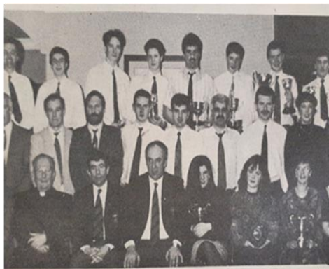
Officials and prizewinners who attended Darragh Cross GAC's annual presentation dinner at the Abbey Lodge Hotel on Friday night.