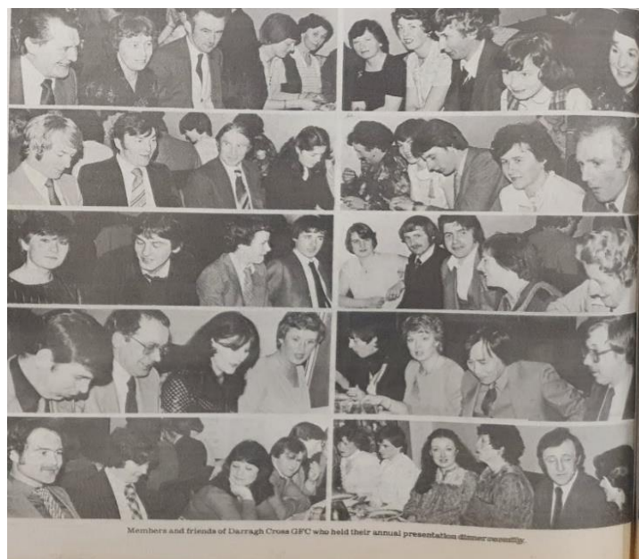
Members and friends of Darragh Cross GFC who held their annual presentation dinner in the Park House Inn, Drumaness on Friday night.