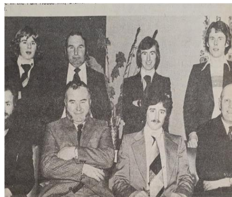
Members of the Darragh Cross GFC's committee who organised the annual dinner dance in the Park House Inn, Drumaness on Friday night.