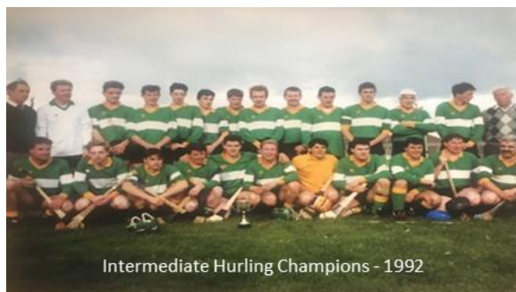
Intermediate Hurling Champions - 1992

teams across the county. The first success was in 1983 when the hurlers won the Special Junior Championship. This victory was the start of a long list of hurling success which included four Junior Championships 1986, 1991, 2001, 2005, three league wins 1983, 1988, 2000 and two Betsy Gray Cups 2000, 2005. However, the biggest hurling success came with beating a strong Ballygalget side to win the 1992 Intermediate Hurling Championship. Camogie was also established in the club and soon brought silverware with several Junior Championship wins in 2006, 2011 and in 2022, when the Camogs beat